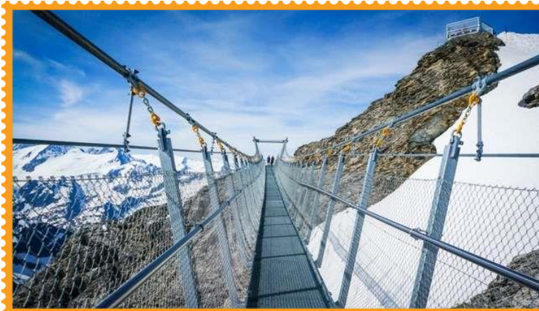
Mt. Titlis Cliff Walk

Today enjoy amazing scenery, a once in a lifetime experience with an exhilarating tip to the top of Mt Titlis at 3020 metres on various cable cars including Rotair, the world's first revolving cable car. Get a breath taking unrestricted 360 degrees stunning view of the dazzling snow