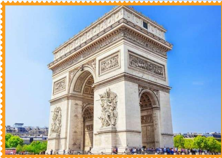
Arc De Triomphe of France.

Today proceed for a guided city tour of Paris. Marvel at the finest Parisian tourist attractions, Place Vendôme, Place de l'Opéra Garnier, Musée d'Orsay, Place de la Concorde, Champs Elysées, one of the most recognised fashionable avenues in the world, Arc de Triomphe, Alexander Bridge, Les Invalides and several others. Next visit the iconic Eiffel Tower – 3rd Level, and get a stunning view of the city from the top. With its famous tapering cast iron tip, the Eiffel Tower is not just the symbol of Paris but of all