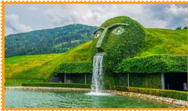
Swarovski Crystal Museum

Visit the magnificent Rhine Falls. Visit Swarovski Crystal Museum – the dazzling world of crystals. Visit Innsbruck – The Tyrolean capital of picturesque Austria.