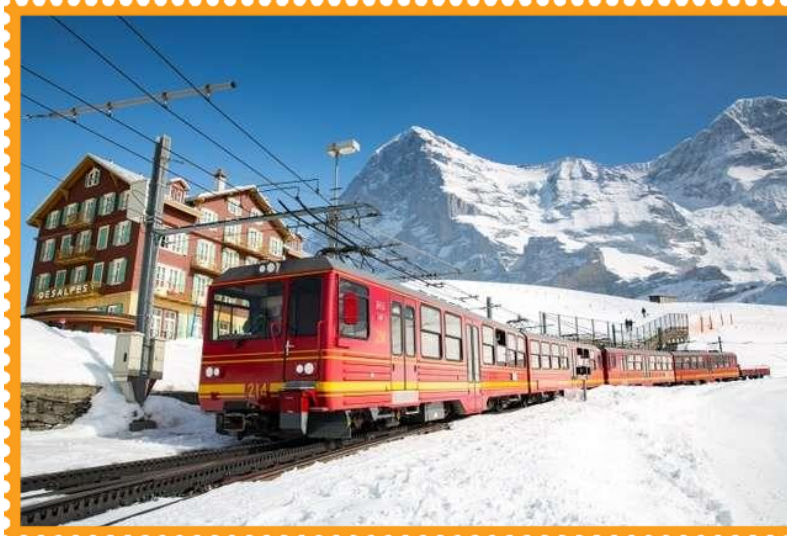
Cogwheel Train to Jungfrauoch included

Enjoy a magical alpine excursion to the top of Europe - the amazing Jungfrauoch which is included in your tour and scenic Interlaken.