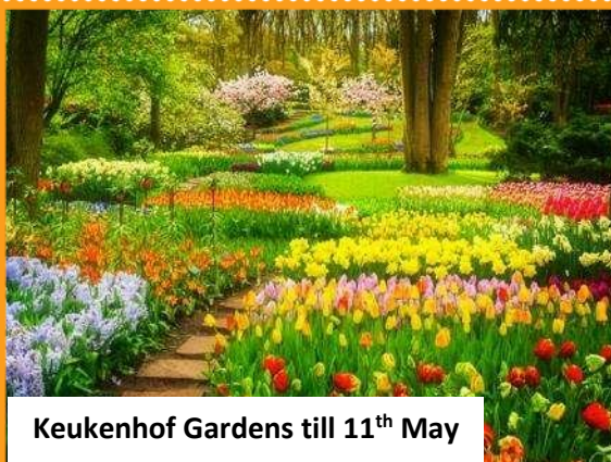
Keukenhof Gardens till 11 th May

(Important Note – Keeping in mind the logistical consideration the Tour Manager reserves the right to alter or change the itinerary. However, we will ensure that all the attractions are covered)