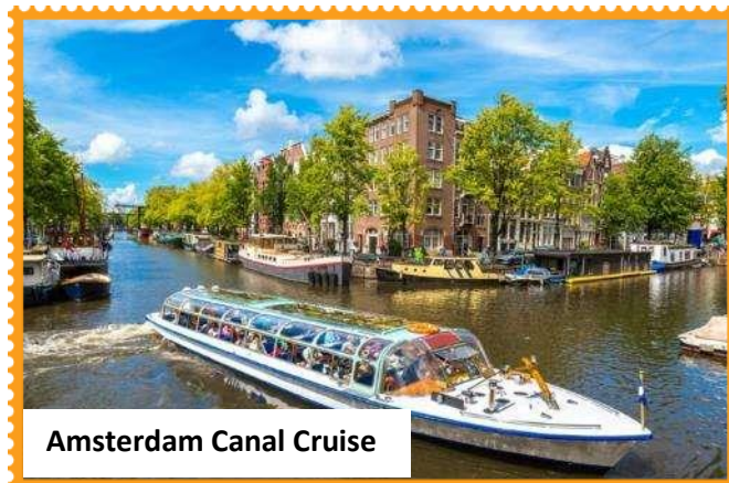
Amsterdam Canal Cruise

Overnight stay at the hotel in Netherlands. (Breakfast, Lunch, Dinner)