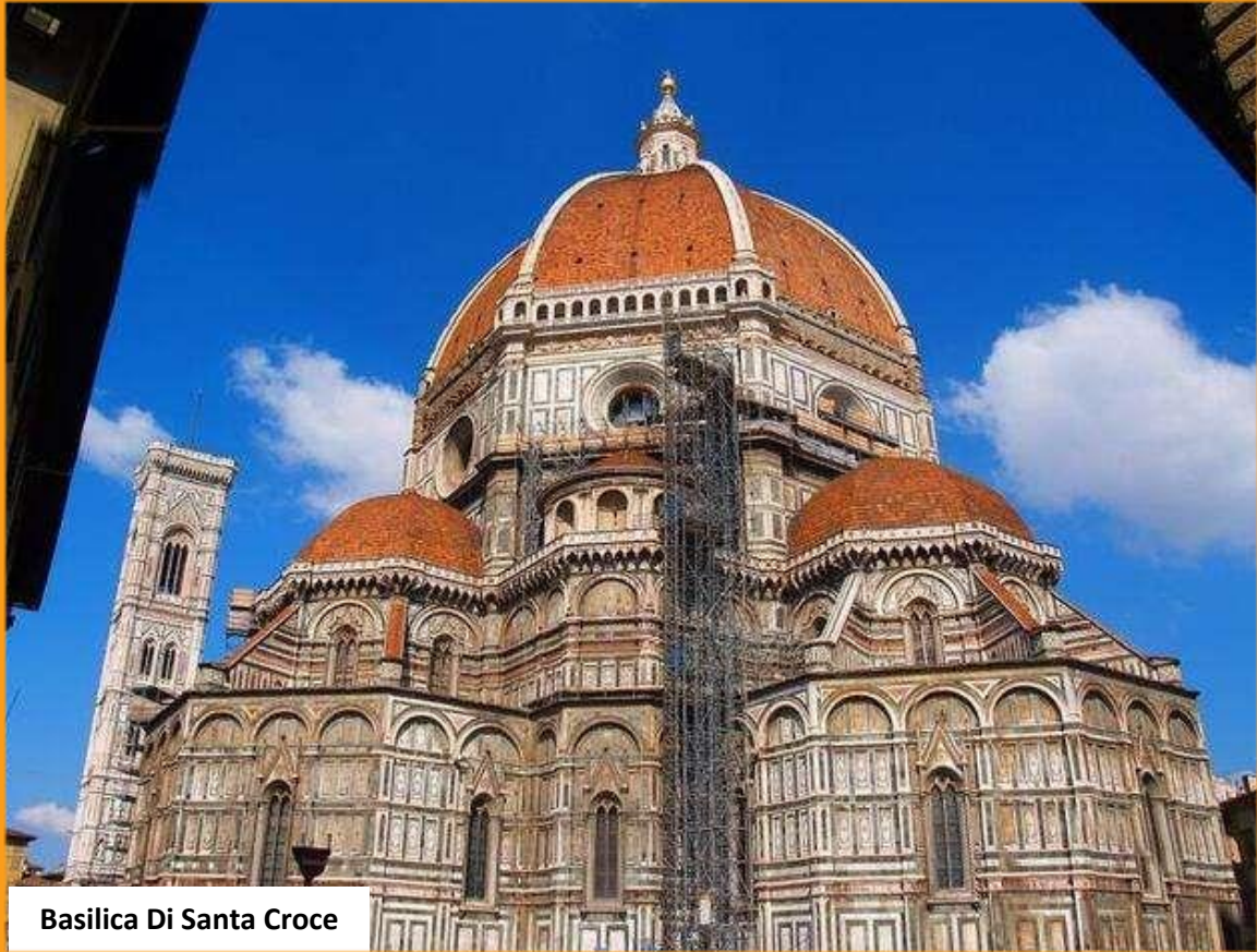
Basilica Di Santa Croce