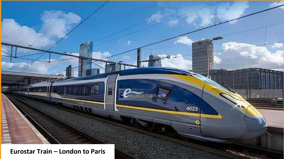
Eurostar Train – London to Paris