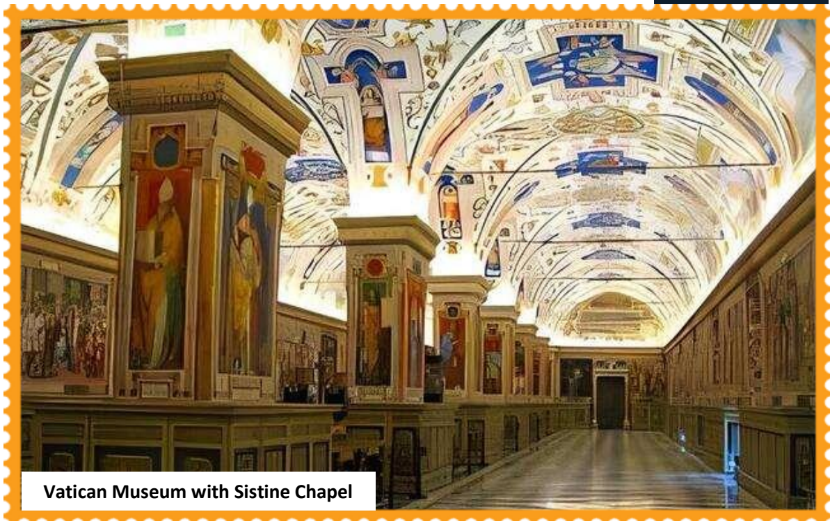
Vatican Museum with Sistine Chapel