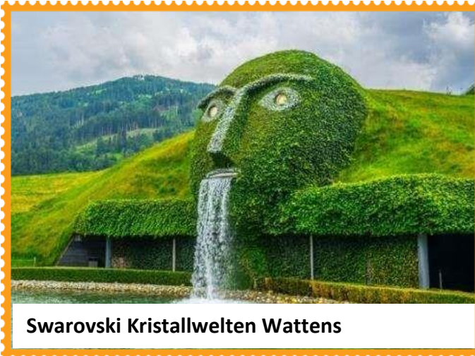
Swarovski Kristallwelten Wattens

Drive to Vaduz, the capital at the Principality of Liechtenstein with a guided mini train ride. Visit Swarovski Crystal Museum – the dazzling world of crystals. Visit Innsbruck – The Tyrolean capital of picturesque Austria.